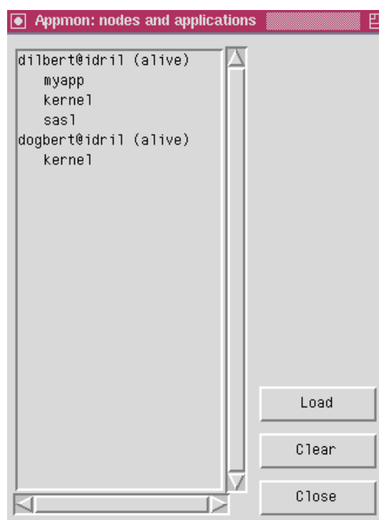
Figure 1.3: The Listbox Window.

The listbox window lists all nodes and applications. This window can be more easy to use than the normal, graphical user interface when the system consists of a large number of nodes and/or applications.