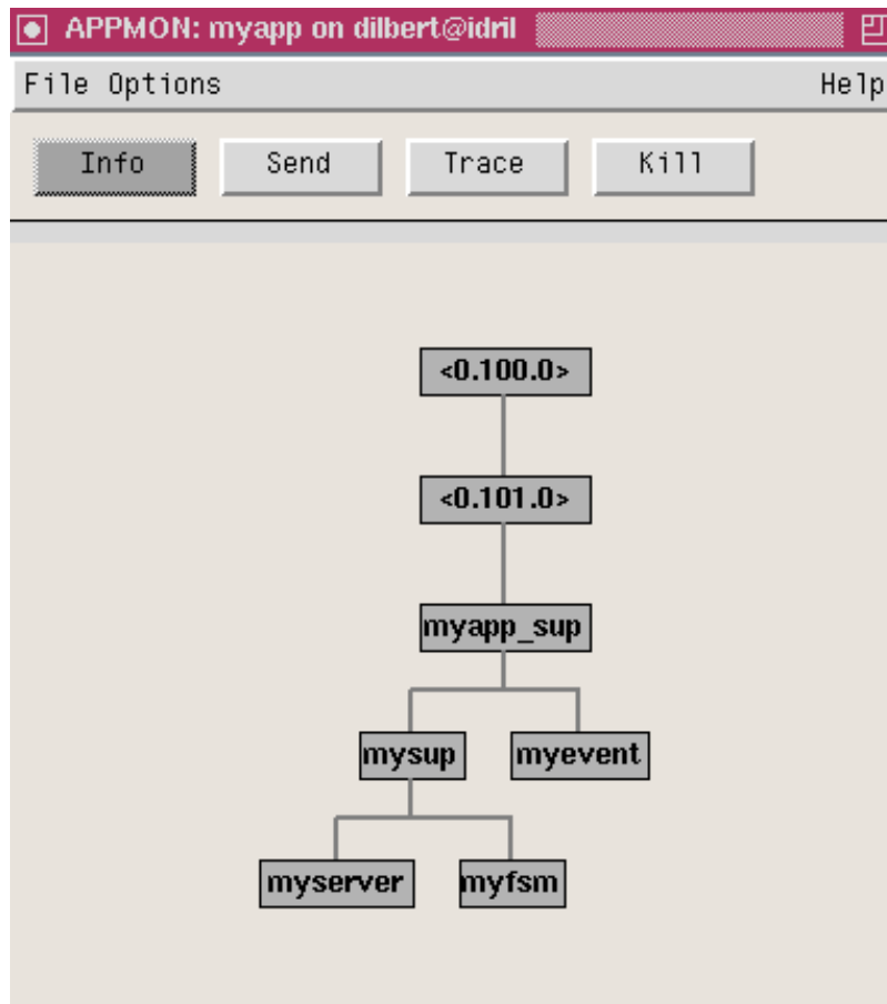
Figure 1.2: The Application Window.

The application can be shown either as a strict supervision tree, or as a process view with all linked processes. In supervision mode, the tree-gathering and -building algorithm assumes conformance to the OTP design principles.